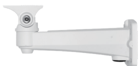
ZN - BK346A Wall bracket